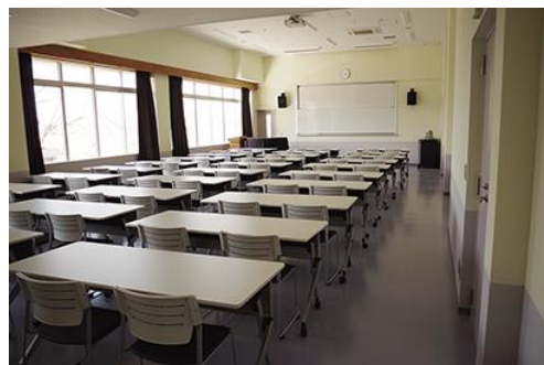
Large Seminar Room