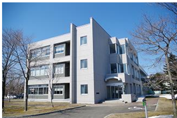
Advanced Course Building