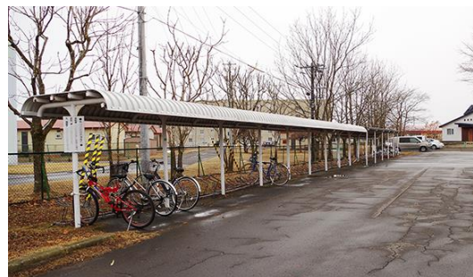
Parking lot for bicycles

Take a train from JR Kushiro station to JR Otanoshike station and walk (about 15 min. walk).