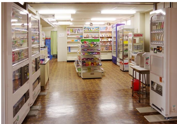
College co-op store